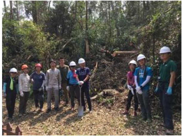
Dung Ping Chau Coastal Cleanup (2018/9/23)