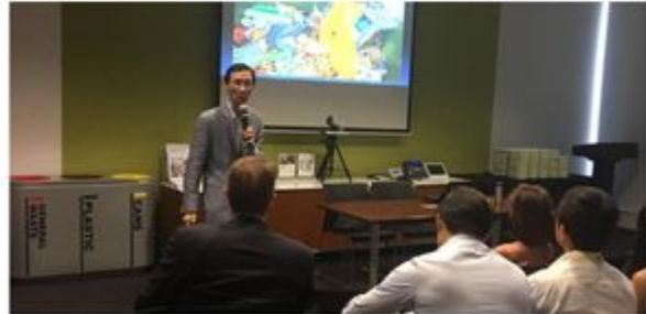
Villa Monte Rosa, Hong Yip Service Company Ltd.